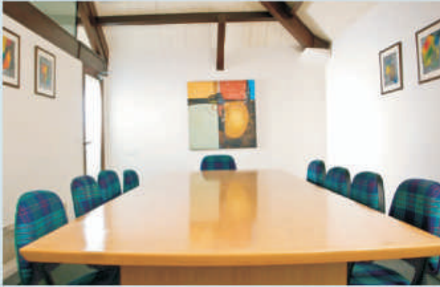
Large conference room for board meetings and discussions