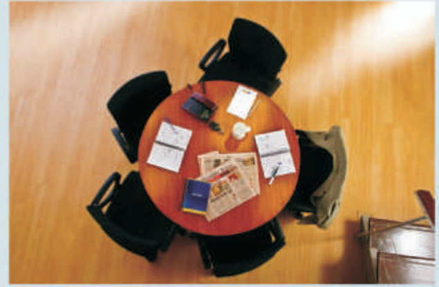
Mini conference rooms for smaller groups and confidential interviews