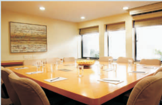
Ideal for presentations and reviews of projects