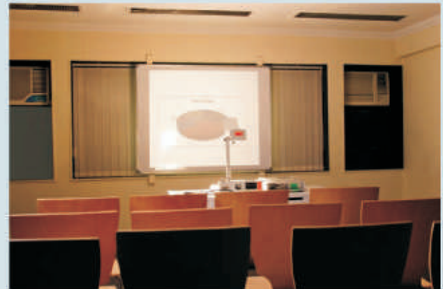
Classroom-style seating, ideal for training sessions and workshops